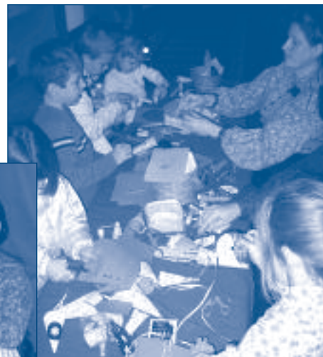
Children make "vintage" ornaments at the Civil War Christmas event (above), while a volunteer gives a demonstration at Thanksgiving on the Battlefield (left). More living histories are scheduled for 2005.

programs with So You Want to be a Civil War Soldier? and So You Want to be a Railroad Engineer? For more information on these events and more, check our