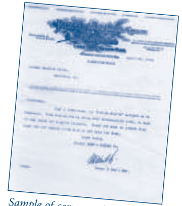
Sample of correspondence from the Glover archives.

The Southern Railway Historical Association has been hard at work processing the materials that have been placed in the Southern Museum. Because of the vast size of this collection, volunteers from the S.R.H.A. have been saving the most valuable papers to make room for the remaining papers currently being stored in several locations. Having the complete archives of the Southern Railway will be a tremendous plus for the Museum. When this collection is processed, it will be a valuable research tool for future historians.