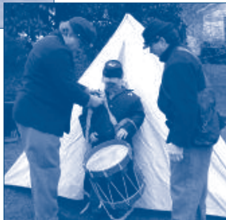
Golfers enjoy last year's golf tournament (top left) while re-enactors help kids experience life as a Civil War soldier during one of the many events held at the Southern Museum.