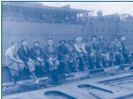
"Women Rivet Heaters and Passers On," unknown photographer, Puget Sound Navy Yard, Washington, May 29, 1919

Courtesy of the National Archives and Records Administration