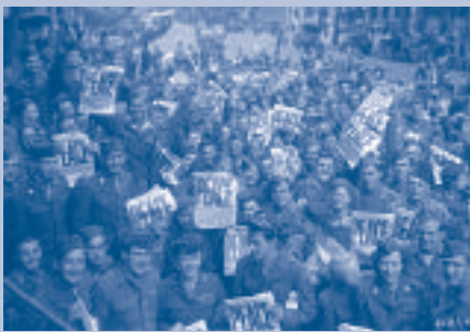
"American servicemen and women gather in front of 'Rainbow Corner' Red Cross club in Paris to celebrate the unconditional surrender of the Japanese," unknown photographer, August 15, 1945

Courtesy of the National Archives and Records Administration