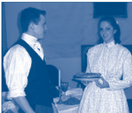
A living historian in 1860s period dress presents a pie as part of the typical Thanksgiving dinner during the holiday event in November.

Museum website for more info at www.southernmuseum.org .